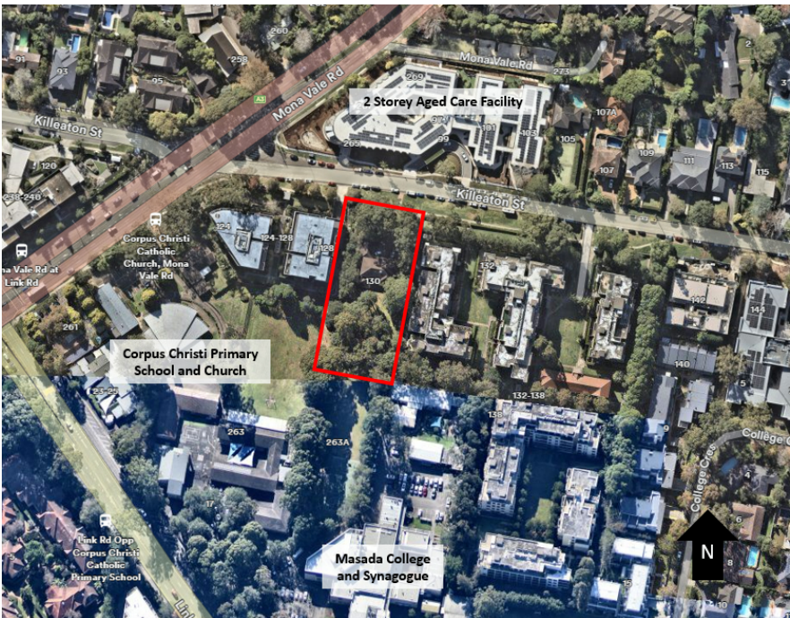
Figure 1 – The site highlighted red

The site is zoned SP2 Infrastructure (Educational Establishment) and is associated with the adjoining Church and Primary school. The site was previously owned by Corpus Christi Catholic Church and Primary School prior who used it for education purposes.