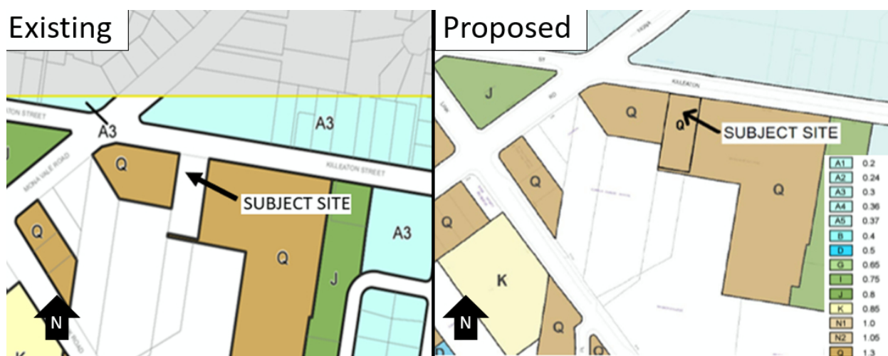
Figure 4: Existing and proposed maximum FSR